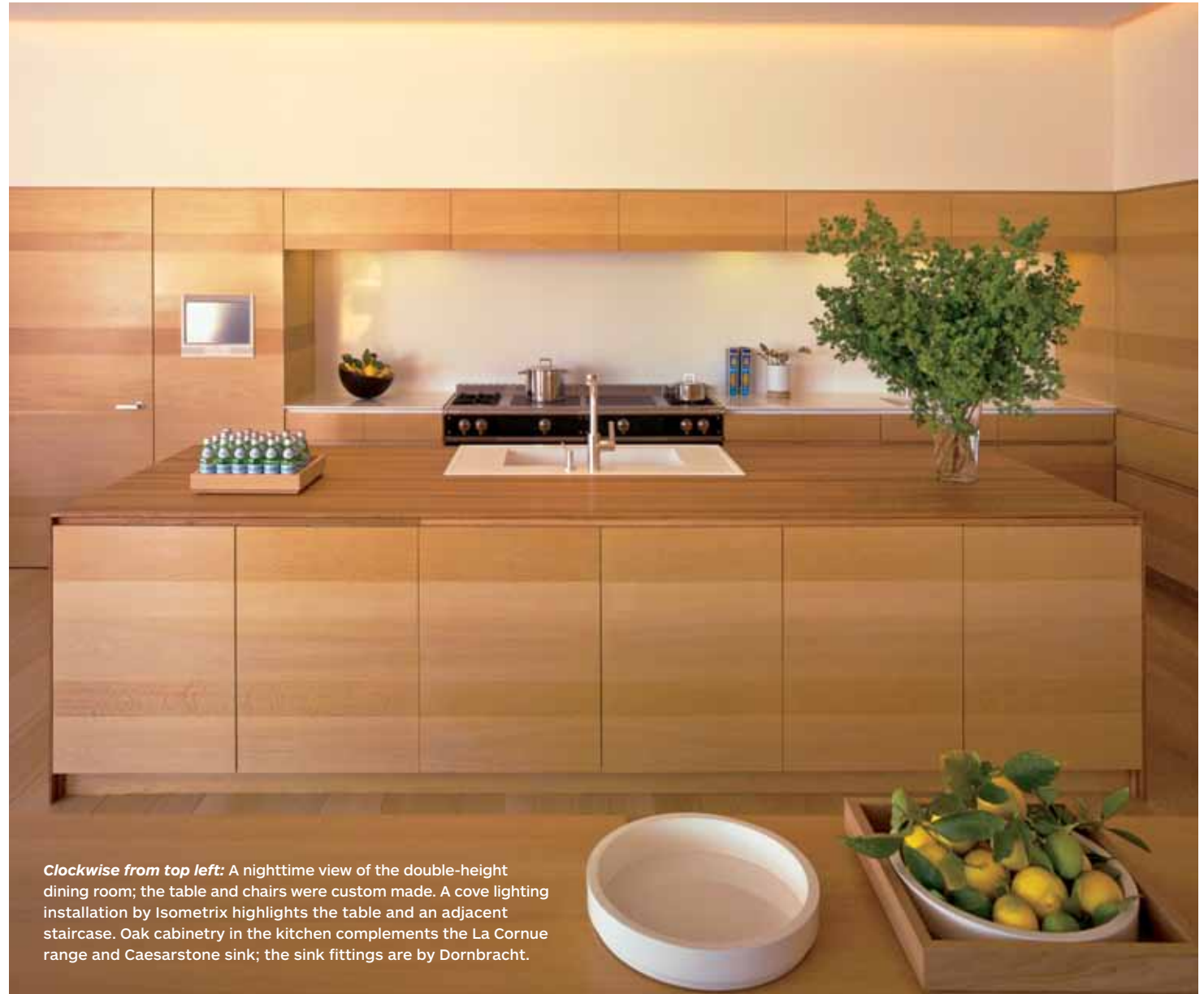
Clockwise from top left: A nighttime view of the double-height dining room; the table and chairs were custom made. A cove lighting installation by Isometrix highlights the table and an adjacent staircase. Oak cabinetry in the kitchen complements the La Cornue range and Caesarstone sink; the sink fittings are by Dornbracht.